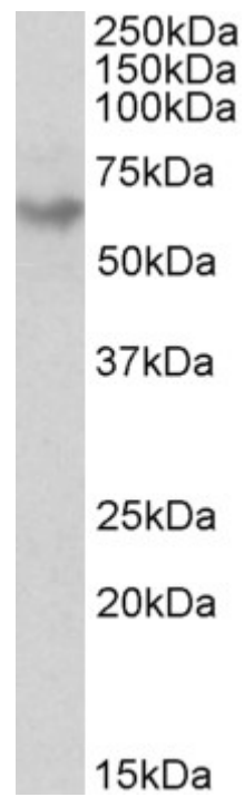
EB06730 (0.5µg/ml) staining of Human Brain (Hippocampus) lysate (35µg protein in RIPA buffer). Detected by chemiluminescence.