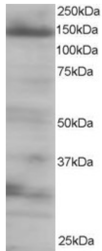
EB06230 staining (0.25µg/ml) of 293 lysate (RIPA buffer, 35µg total protein per lane). Primary incubated for 1 hour. Detected by western blot using chemiluminescence.